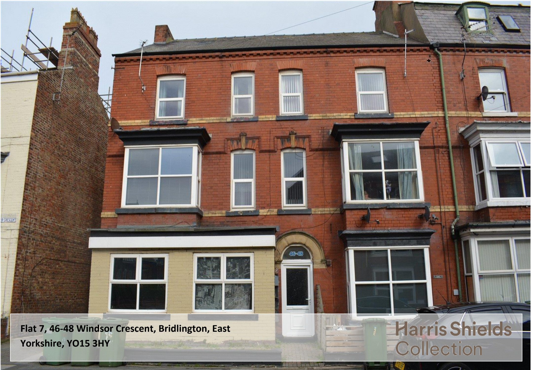
Flat 7, 46-48 Windsor Crescent, Bridlington, East Yorkshire, YO15 3HY